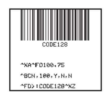
Figure B: Subset B with start character