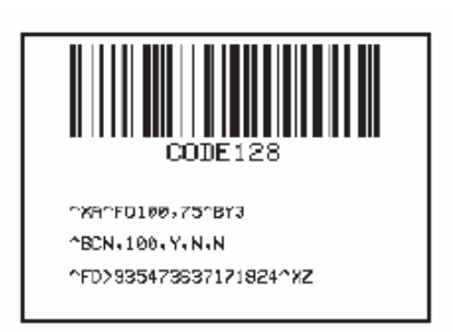
Figure C: Subset C, Normal Data