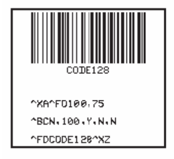
Figure A: Subset B with no start character

Since Code 128 subset B is the most commonly used subset, ZPL® defaults to subset B if no start character is specified in the data string. This is demonstrated in following two